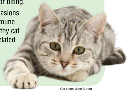
Cat photo: Jane Burton

The good news is that there is a very effective vaccine, giving cats protection against this deadly disease. Please contact us for further information or an appointment.