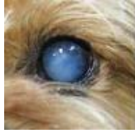
Cataract in dogs' eye